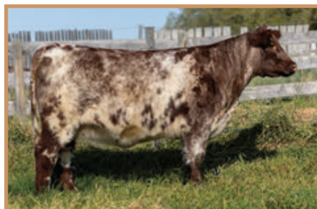
daughter - 3K