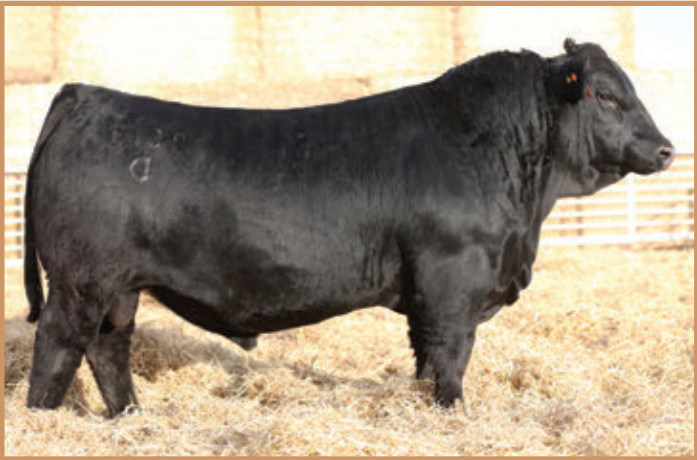
SIRE - LFE NIGHT HAWK 3013D

100L is the only Simmental Bull on offer but he is a very good representation of the Simmental breed. He was used on commercial heifers and cows last year and bred extremely well. His mother has been a top cow and is in the herd now being utilized in our Shorthorn Plus program. If you have a few extra heifers or young cows to breed than you should have a good look at 100L on sale day.