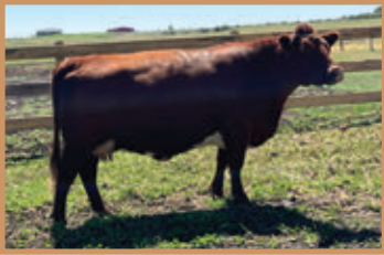
DAM - DIAMOND FINEST MAID 34F

This rugged, big bodied, long-spined, sound-made bull proves calving ease is about shape more than BW. He was born unassisted in under 30 minutes and was up and sucking within minutes. We are so keen on this bull that we had initially intended to retain him for his multiple exceptional traits. Diamond Finest Maid 34F is a functional, wide-topped female with the high quality we strive for here at Diamond.