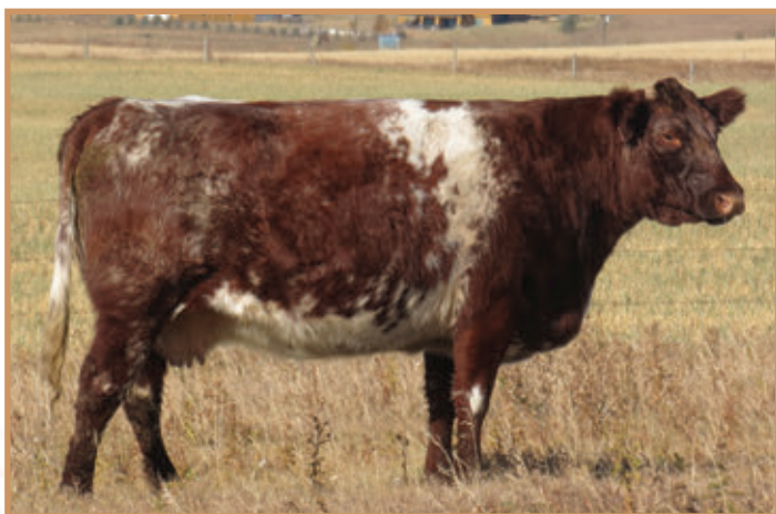
DAM - DIAMOND ZEALOUS BARONESS 5Z

A full brother to Diamond Hendrix 2H, whom we appreciated enough to be used last summer at TGN Shorthorns. Lucrative has performance, an attractive deep jaw, wide back, big foot, significant hip, and sound structure. With a dam like Diamond Zealous Baroness 5Z, you can count on having highly productive daughters and outstanding sons; every bull she has produced was sold as a herd sire, and the full brothers in this sale are among the best! When we select a herd sire or offer a herd sire, we emphasize the dam, her phenotype, and maternal capabilities to allow our customers to take out the guesswork.