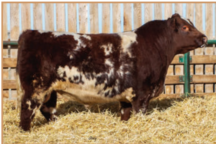
SIRE - DIAMOND HENDRIX 2H