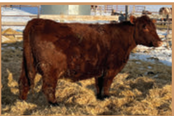
DAM - DIAMOND HAND MAID 32H

A roan, stouter made son of Diamond Hendrix 2H. His CED puts him in the top 5% of the breed. This bull received significant consideration for our showstring last fall. He is good and has been a calf talked about since birth. His maternal grandsire is the great Diamond Belvedere 29B, who also sired the female that produced the Supreme Champion Bull at Brandon Ag EX 2021 Hatfield Andrew 71H.