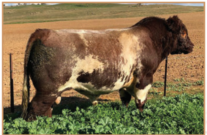
SIRE - ROYALLA ROCKSTAR