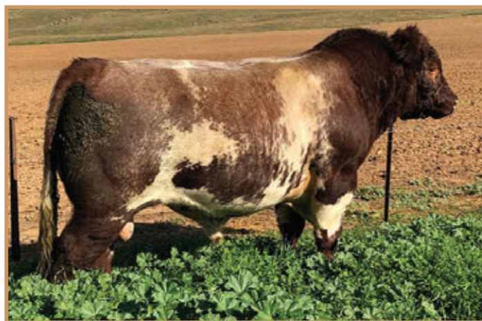
SIRE - ROYALLA ROCKSTAR K274