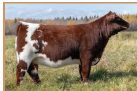
daughter - 19L