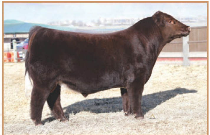
SIRE - LITTLE CEDAR WORLDWIDE 1979