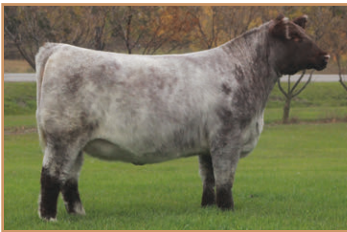
DAM - LITTLE REBEL KNAY KNAY 2K

Safe Word 101K has been an absolute favourite since birth. Being out of the breed matron Little Rebel Knay Knay and the great Diamond Hendrix, he is bred for absolute greatness. Safe Word is very soft made and deep middled, big volumes, sound footed and extremely attractive. Combining the perfect amount of calving ease, maternal strength and power we feel he is a bull that is going to leave a very positive mark on the breed. We plan on utilizing his genetics in both the cow and heifer pens this spring. Selling 1/2 semen interest, no possession for 2 breeding seasons. Willing to negotiate possession with later breeding herds. Show rights reserved until the end of Canadian Western Agribition 2026. Option to double up the winning bid and own 101M in his entirety.