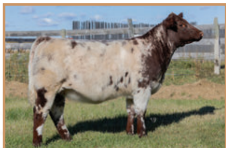
daughter - 8M

Terms: One IVF flush to be completed at DBK Genetics. Guarantee of 6 freezable embryos with no cap. Half down sale day with the remainder due at time of flush. 102H is booked in for March 5, 2025, choice of this date or a later date.