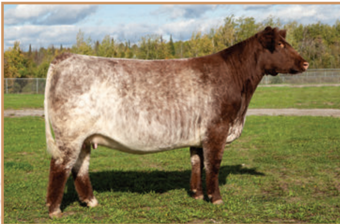
DAM - BLENVIEW GLAMOROUS ANNIE 102G

Ringleader is a bull that everyone will remember. He was campaigned alongside the $45,000 Blenview Glamorous Annie and then went on to be a favourite and high seller at the Canadian Premier Sale. Through some unexpected events that turned out to be fortunate in the end he ended up in our herd. We have used him 2 breeding seasons now and with out very small herd it is time to move on. Ringleader is without out a doubt the fastest maturing, highest growth and most powerful shorthorn bull we have ever laid eyes on. If you're looking to add pounds to your calves without sacrificing structure, maternal and longevity then this is the bull for you.