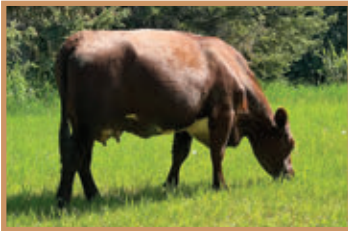
DAM - DIAMOND 2ND HONEST MAID

If you are seeking a solid red, polled, wide-topped herd sire with a $CEZ in the top 20% of the breed, $BMI in the top 20%, and $F in the top 30%, 37M needs to be on your list. If you are looking for a standout bull whose dam is a tremendous young Royalla Rockstar K274 daughter and sired by Diamond 2nd Hubback 38H. 2nd Hubback 38H is an outstanding bull out of great producing daughter of Crooked Post Grissom 24T and sired by the phenotypically phenomenal Diamond Belvedere 29B.