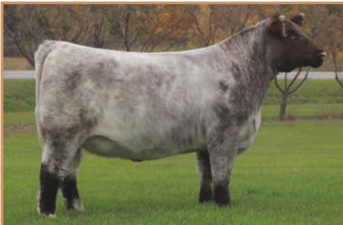
DAM - LITTLE REBEL KNAY KNAY 2K

Selling 50% interest and no possession. Option to double up the winning bid and own 56M in her entirety.