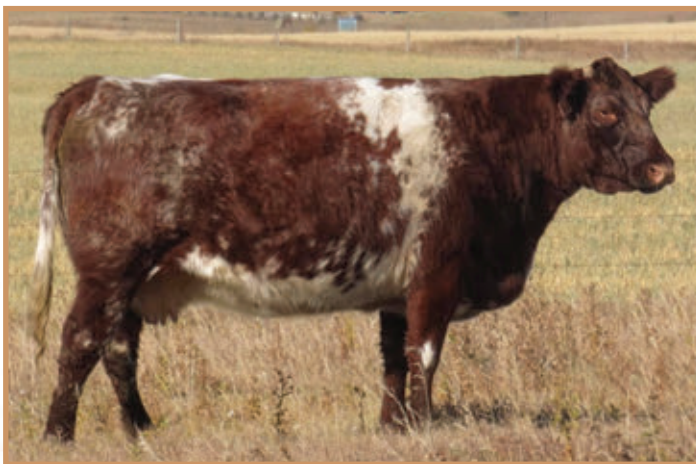
DAM - DIAMOND ZEALOUS BARONESS 5Z