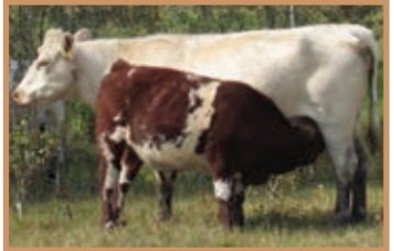
DAM - SIX S APRIL 55A