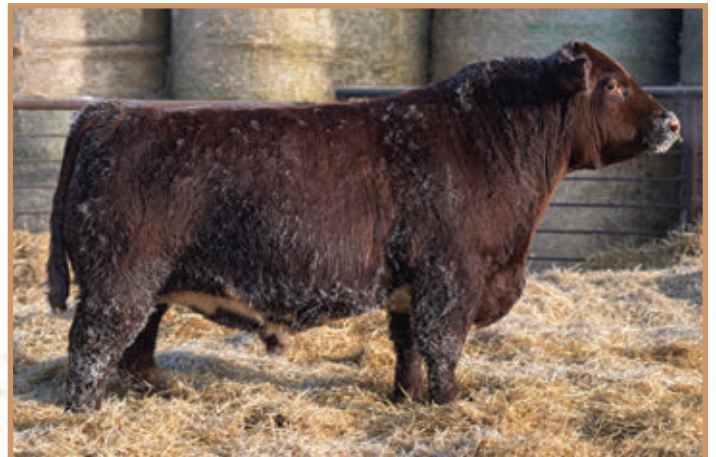
SIRE - GILMAN'S ALL IN 6K