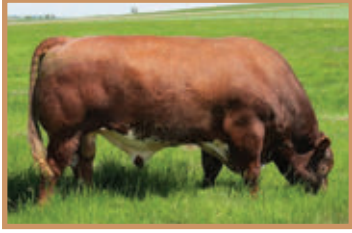
grandsire - DIAMOND BELVEDERE

Montgomery has scale crushing performance, big foot, and sound structure while oozing eye appeal. His granddam, Six S April 55A, has been the best producing cow in my herd, 55A's daughter and sons elevate my program to the next level. TGN Eileen 3E is an outstanding JSF Addicted 82U granddaughter. His sire, Diamond 2nd Hubback 38H, is one of the most impressive bulls out of a front pasture cow at Diamond Shorthorns. You'd be hard-pressed to find a better set of EPDs this season with 11 out of 12 above-average traits. Montgomery is the ultimate breeder bull with a unique pedigree and an outcross to many programs.